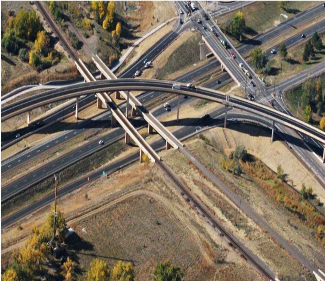
C-470 & Sante Fe Drive